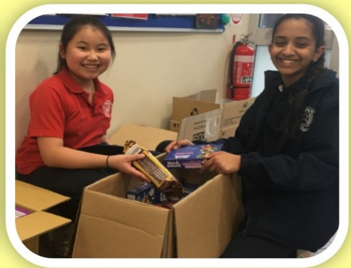
Our Lady of Dolours School students